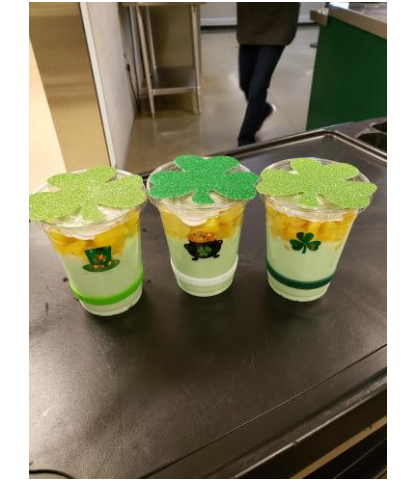
ST PATRICK'S DAY!